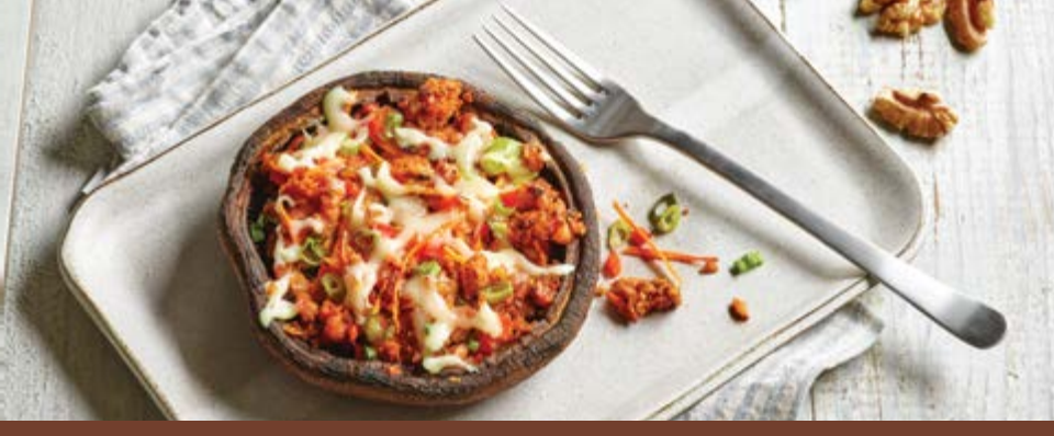
Prep Time: 5 min / Cook Time: 5 min / Total Time: 10 min Servings: 1 / Serving Size: 1 portobello mushroom