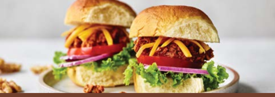
Prep Time: 5 min / Cook Time: 10 min / Total Time: 15 min Servings: 1 / Serving Size: 2 sandwiches