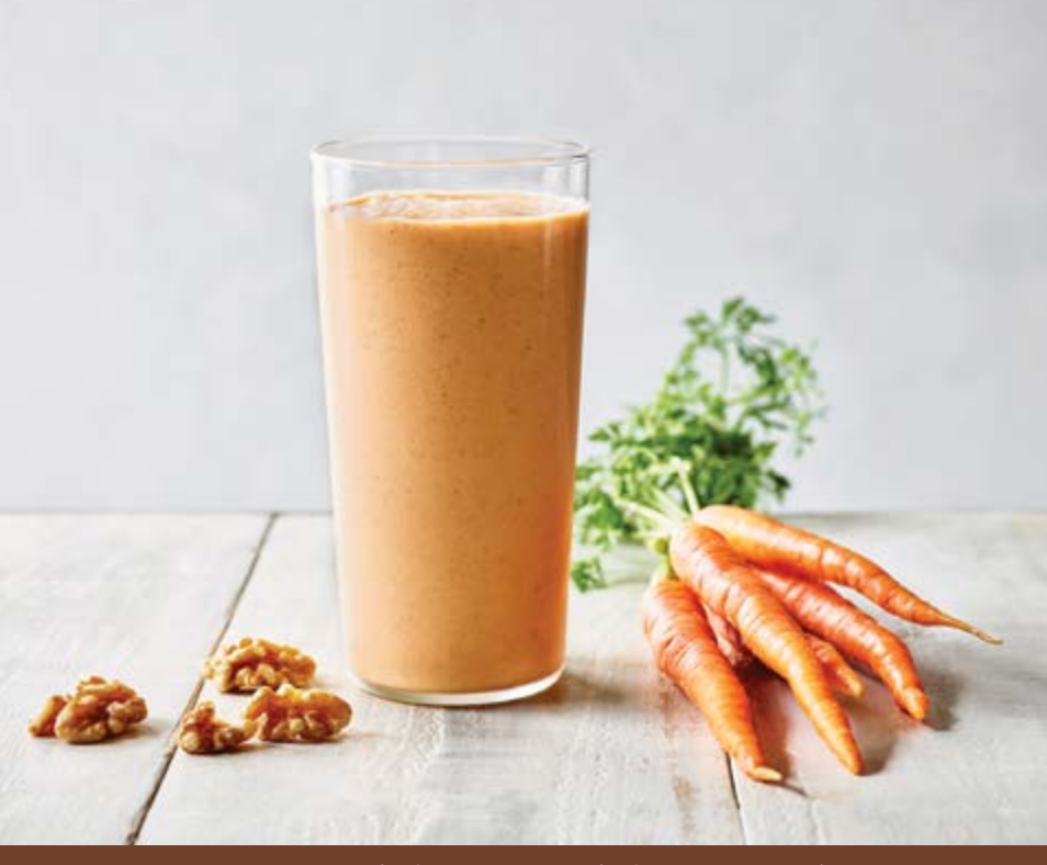
Prep Time: 15 min / Cook Time: 0 min / Total Time: 15 min Servings: 1 / Serving Size: 16 ounces