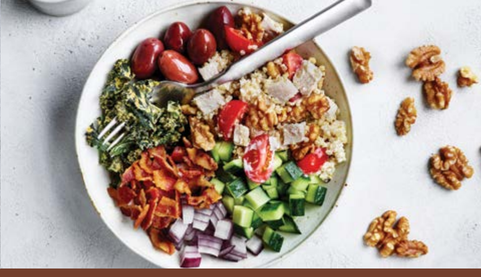
Prep Time: 5 min / Cook Time: 5 min / Total Time: 10 min Servings: 1 / Serving Size: 2 cups