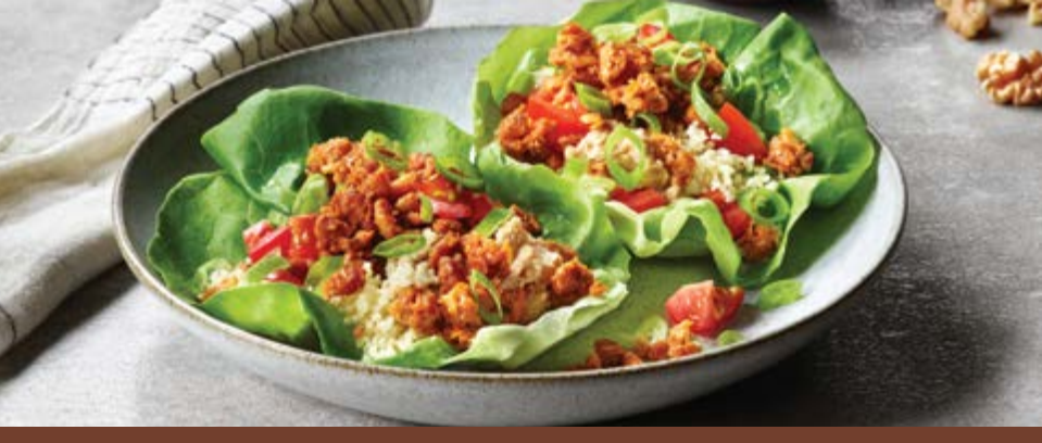
Prep: 35 min / Cook Time: 10 min / Total Time: 45 min Serves: 1 / Serving Size: 2 wraps