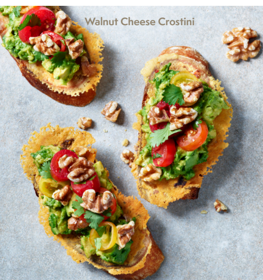
Walnut Cheese Crostini

*Heart-Check food certification does not apply to recipes unless expressly stated. See heartcheckmark.org/guidelines . Supportive but not conclusive research shows that eating 1.5 ounces of walnuts per day, as part of a low saturated fat and low cholesterol diet and not resulting in increased caloric intake, may reduce the risk of coronary heart disease. (FDA) One ounce of walnuts provides 18g of total fat, 2.5g of monounsaturated fat, 13g of polyunsaturated fat including 2.5g of alpha-linolenic acid – the plant-based omega-3.