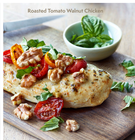
Roasted Tomato Walnut Chicken